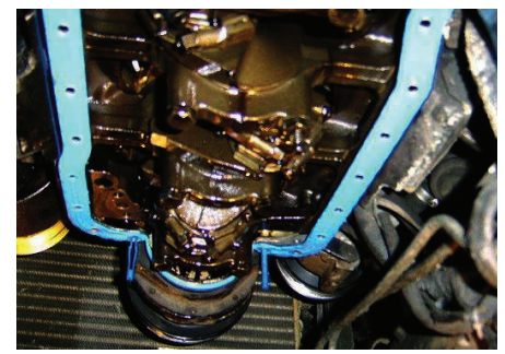
Example of a quick installation using SnapUps®