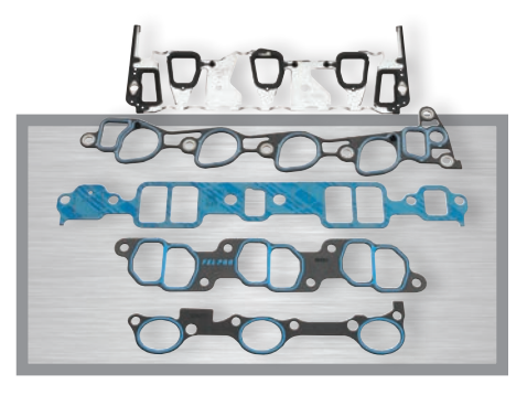
Manifold Gasket Sets* Where applicable, Fel-Pro offers a premium PermaDryPlus<sup>®</sup> problemsolving gasket for applications that have proved troublesome in the aftermarket repair environment.

Oil Pan Gasket Sets* Fel-Pro oil pan gaskets, like valve cover gaskets, typically feature a rigid carrier design, molded-rubber, cork-rubber or synthetic rubber.