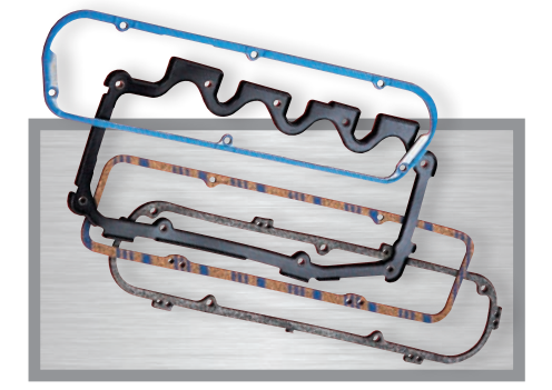
Valve Cover Gasket Sets* Valve cover gaskets are the most common leak repair product. Fel-Pro offers a full range of valve cover products to cover a variety of applications and repair needs.

Backed by the industry's largest brand of leak repair gaskets, Fel-Pro offers technicians products with the materials and the technologies to seal pesky leaks quickly and successfully.