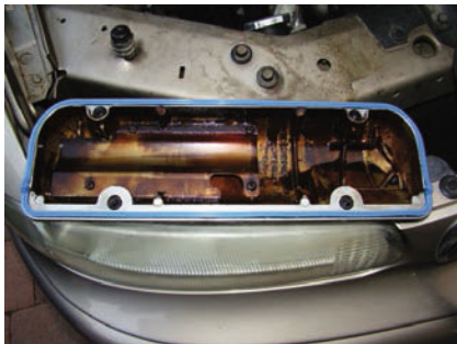
PermaDry® gasket installed dry

PermaDry® gaskets are intended for vehicles which used a molded rubber gasket as original equipment. These gaskets are made using Fel-Pro's proprietary molded rubber formulations and are precision engineered for each application. To guarantee a leak-free repair, PermaDry gaskets must also be installed without the use of additional sealants.