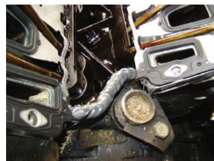
PermaDryPlus® intake gaskets installed dry: RTV used for end seals.