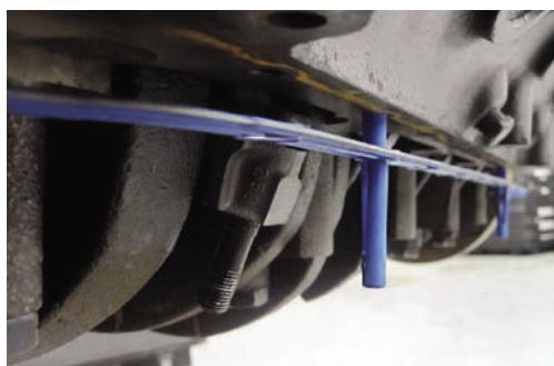
SnapUps® in action