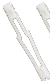
ES 72865 – for all 8mm bolts