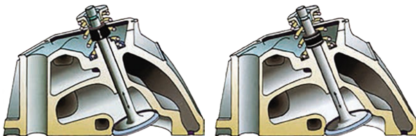
Deflector seals move with valve stem