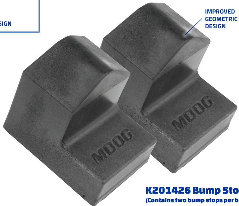
IMPROVED GEOMETRIC DESIGN