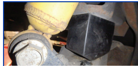
MOOG K201426 INSTALLED