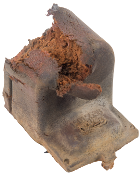
WORN OE DESIGN