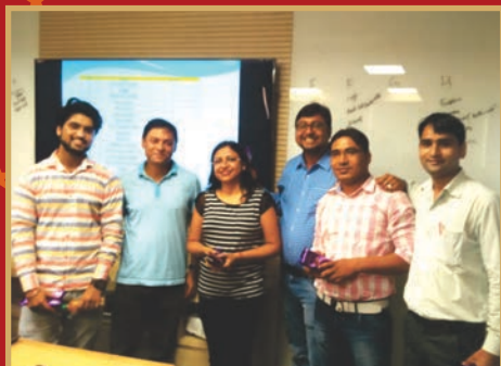
Employee Engagement Activity- Treasure Hunt held at Gurgaon HO on 16 th September 2016