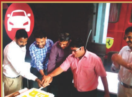
Monthly Birthday Celebration held at Gurgaon HO on 3 rd October 2016