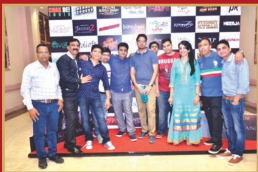
F-M Finance team at Family Day Event