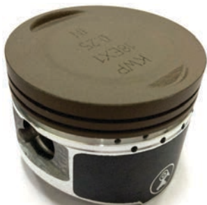
HONDA ACTIVA 110CC