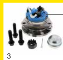
Integrated impulse wheel & ABS sensor