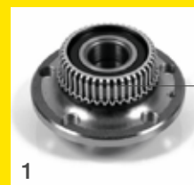
Passive impulse wheel located on wheel end

*This type of impulse wheel is difficult to identify with the naked eye and requires special care when handling and installing. Check MOOG ESB "Wheel End Bearings with integrated magnetic ABS impulse wheels" for more information